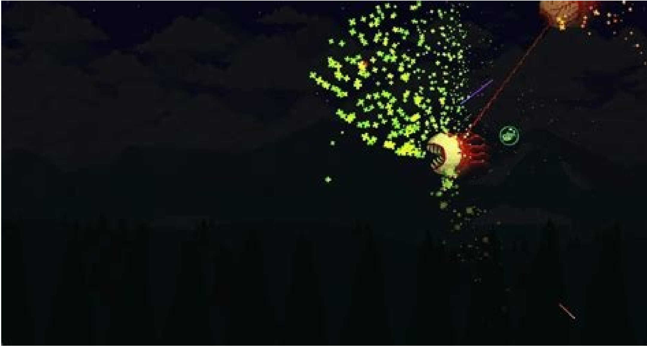
Terraria calamity summoner progression guide.